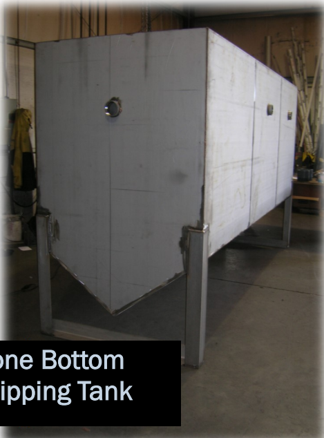
Cone Bottom Stripping Tank

We offer hopper bottom tanks to go with these systems which aid in settling these metals and allow the used to extract the solids without even shutting down the system. Thus, all the solids and iron that would normally be clogging up your air stripper, fall harmlessly to the bottom of our storage tank.