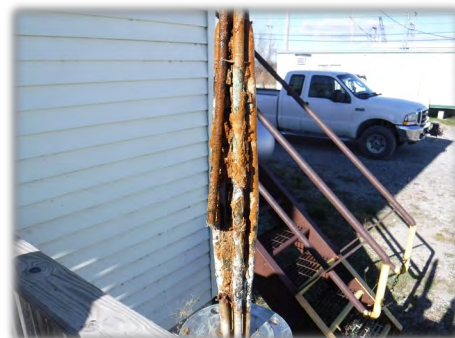
Stripping benzene from water with 1000 mg/l of hardness destroying 316 stainless in 4 months