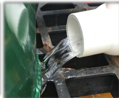
Direct filtration of municipal wastewater

Simplicity and Sustainability through Innovation