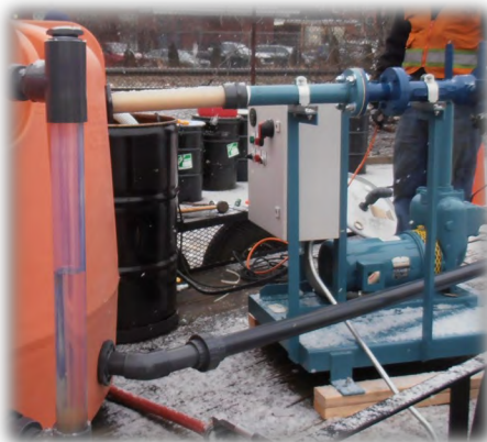
Direct oxidation of 60 mg/l of iron using air while stripping