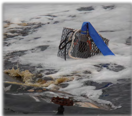
Stripping 1000 mg/l of ammonia from leachate

Theia provides engineered solutions to your most difficult applications. That is not always enough. Sometimes the application presents operational challenges that would render typical treatment systems useless in short order. Theia is more than up to the challenge.